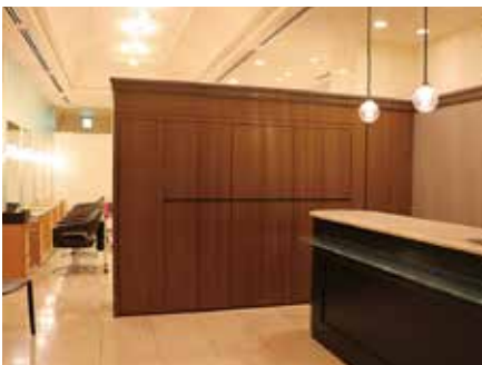
Hatsuko Endo Weddings

Akiyama Photo Studio provides photography services for weddings, traditional ceremonies such as coming of age and shichigosan, and other key milestones.