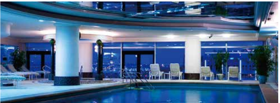
HARBOR VIEW FITNESS CLUB

Enjoy ultimate healing at Spa BAY WINDOW, with its blissful spa treatments, and at the Harbor View Fitness Club, with its full line-up of training equipment, a swimming pool, and whirlpool baths.