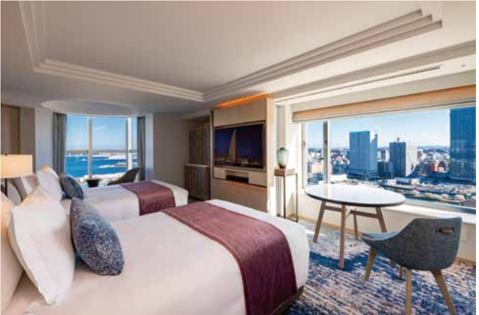
Suite Panoramic View