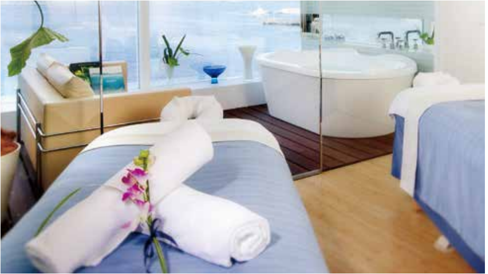
Spa BAY WINDOW