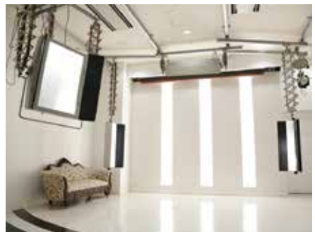
Akiyama Photo Studio