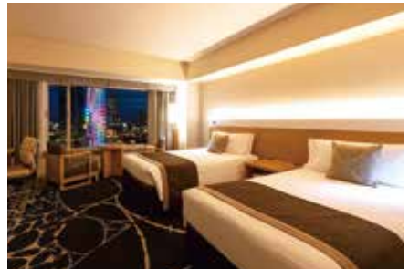
Premium City View