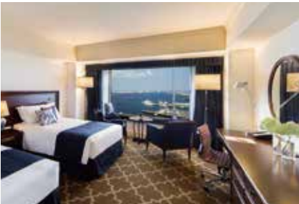
Premium Club Access Harbour View

Harbour View rooms offer sweeping vistas of the Yokohama port area and Bay Bridge, while City View rooms look out over the Red Brick Warehouse and giant Ferris wheel. Generous windows provide panoramic views for the perfect backdrop to a relaxing stay. We also offer a range of rooms including suites to suit varying requirements.